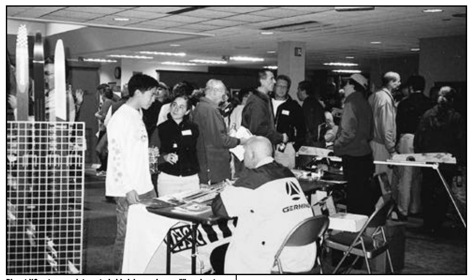
Planet XC gets many interested ski club members milling about their booth.

"Hey, I know some of the things I saw at the Vendor Fair would make great gifts, and I even know where to get them."