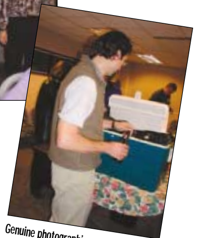
Genuine photographic proof that even really good skiers enjoy a beer every now and then.