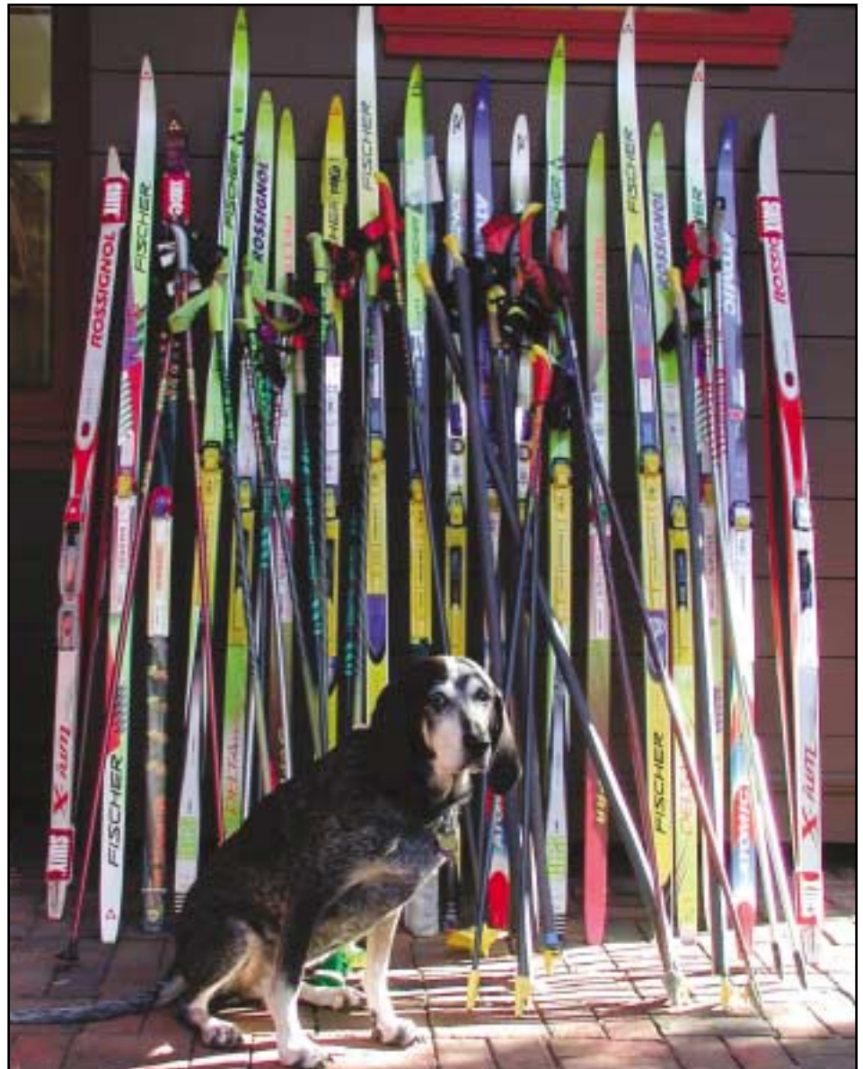
Her owners, skis.

To get to the point, last weekend I discovered we had 14 pairs of skis hidden away in various places. This represents an accumulation rate of 0.25 pairs of skis per person year. I don't think we are that atypical, although we do have a little trouble getting rid of things. If we aren't that strange, it would seem that all Mad-