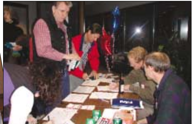
The board was busy taking checks for new memberships and membership renewals.