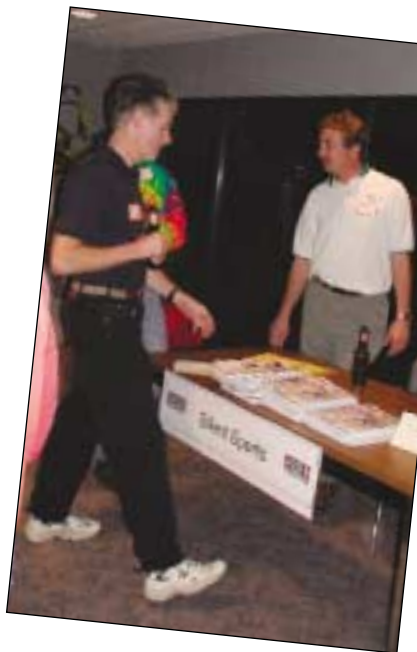
Club members kept the booth workers busy, asking questions and gathering information.