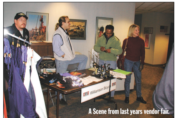
A Scene from last years vendor fair.

The last two years we have been blessed with many advertisers who have contributed to all the raffles we have at every meeting. So to all you lucky winners, it's time to give