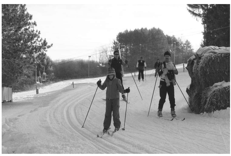
MadNorSki skiers enjoy real snow in November within a 20 minute drive from Madison. Tyrol Basin's white slopes provide for fun, social mornings in the early season.

We will again be providing everything at cost, which is $15.00 for a full-day non-tow pass at Tyrol Basin. This money goes to support the snow