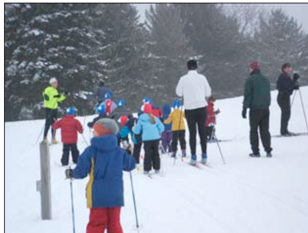
KidSkiers what it's all about at Odana Golf Course.

All participants receive ski bibs with Club logo and number. Attendance every week is not required. Check