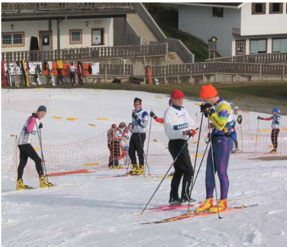
An early chance to get on snow at Tyrol Basin left most MadNorSkis enjoying the warm temps and socializing. But it was sure fun!