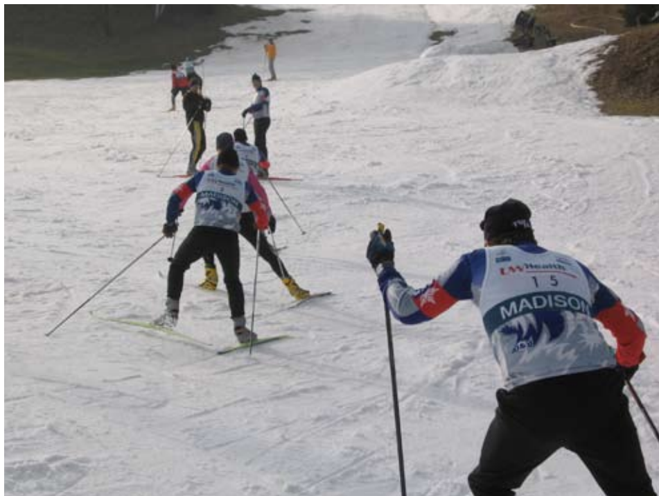
Always ready to ski at a moment's notice; MadNorSkis enjoy a day on some real snow at Tyrol Basin, November 18.

With the unpredictable nature of when and where we can enjoy our recreational pursuits there is one thing