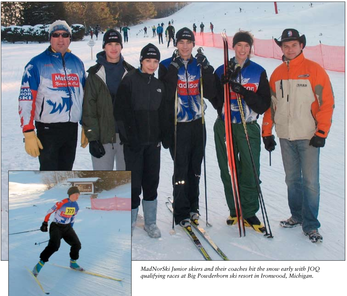
MadNorSki Junior skiers and their coaches hit the snow early with JOQ qualifying races at Big Powderhorn ski resort in Ironwood, Michigan.

We were all happy to have had the time on snow. We returned to Madison to face a week of 40 plus degrees, but in spite of the heat we still caught a fun night of skiing at Tyrol Basin on Tuesday night. The rest of the team is looking forward to the chance of getting into their first race of the season. Over winter break we all hope to find some snow. It looks like roller skiing could be back in the cards again.